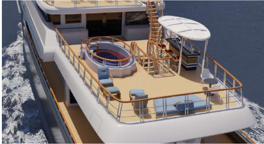
The deck lounge features a heated pool and a shaded drink bar

The exterior has a wide range of spaces that will appeal to both large and more intimate groups. This explorer has a logical layout and many functional elements, arranged artfully. One of her hallmarks is the transformability of some areas , such as the Aft Deck and the Sky Lounge.