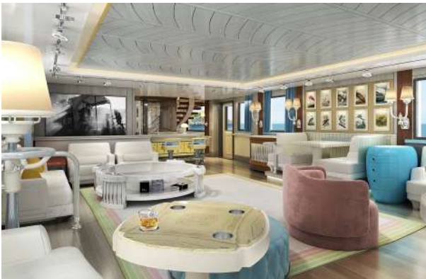
Main salon lounge, light palette version

The interior of Commodore, like the exterior, features multi-uses spaces : the arrival lobby serves as a drinks bar, and the skylounge serves as a day lounge, reading room, formal banquet hall, or business meeting center.