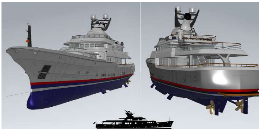
Proven maritime forms: flared bow and heart-shaped stern.

The combination of easy-going hullform, large yacht tenders, versatile deck spaces, effective crew circulation, and logical service layout, make the Commodore an effective leisure machine .