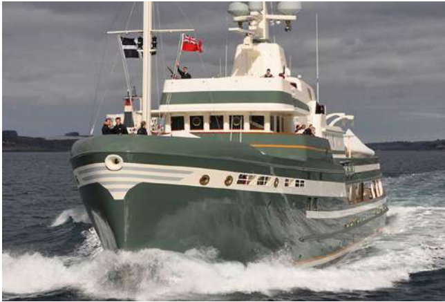
LP Design's 55m Steel, launched in 2009.

The Commodore 57 and the 55m Steel are both classically timeless, functional and robust ships that can faithfully and safely accommodate family and guests around the world in all conditions.