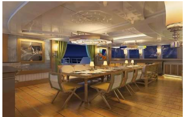
Skylounge in the formal banquet hall configuration

Liebowitz & Partners https://LPdesignUK.com/ Commodore 57 http://www.commodore57.com/