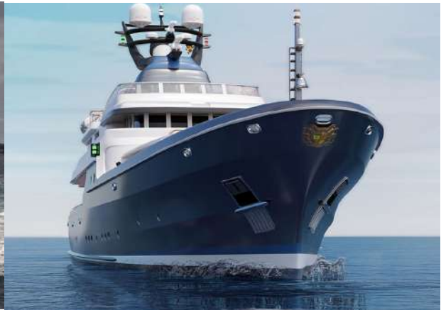
Commodore's bow features a personalised coat of arm.

With regard to the external envelope, this vessel denotes enduring aesthetics and proven maritime forms that ensure comfort both underway and at anchor.