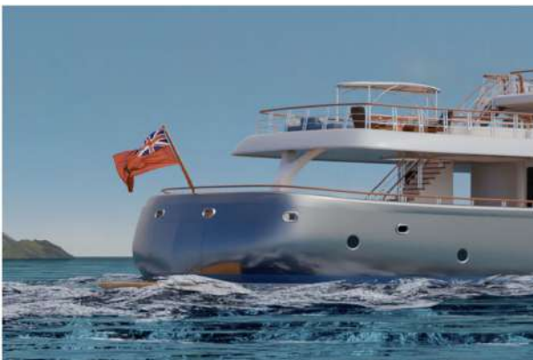
Aft view of the clamshell door and the platform

The beach club area is one deck below, and it includes a sauna ( a circular steam Banya ) as well as a treatment and massage suite . A unique clamshell stern door gives access to a teak wood swimplatform. A second, bottom-hinger beach platform emerges from the port side.